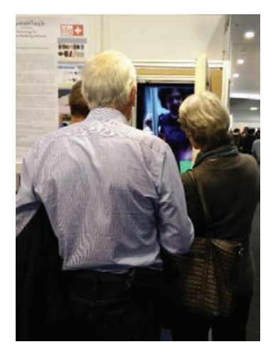
Figure 1. Older adults interacting with a displaceable version of the Tangible Interactive Window during a healthcare event in Lausanne, Switzerland.