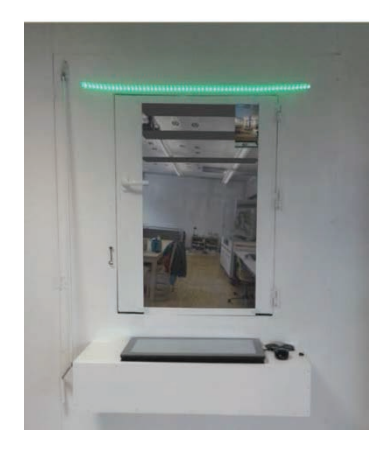
Figure 2. The Tangible Interactive Window installation in Biarritz, France, seamlessly integrated in the environment and connected to the University of Applied Sciences of Western Switzerland, in Fribourg.