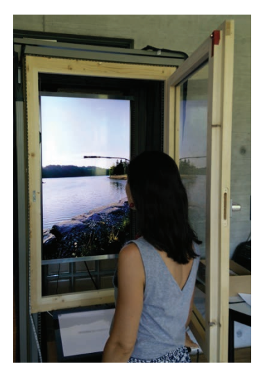
Figure 1: A demonstration of the Virtual Tourism Concept. A Tangible Interactive Window playing a HD portrait video of a natural landscape.