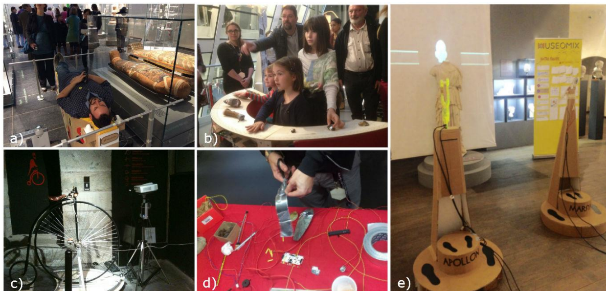
Figure 2: Museomix prototypes a) Momix b) Prehistopiano c) Museocyclette d) Making-off Prehistopiano e) Hero des Lyres