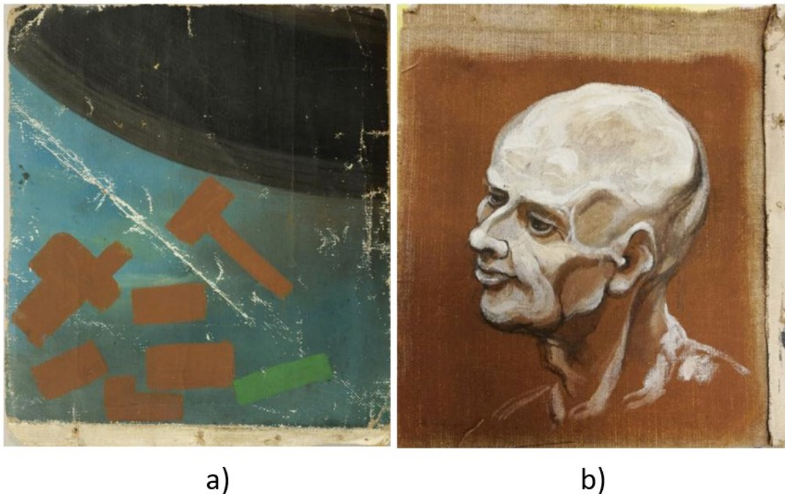
Figure 1. Image of the reverse side of the canvas with signatures applied under brown and green layers of paint (a) and the front side of the canvas with the image of a human head (b).

A TeraPulse Lx system was used to produce ultrafast ( \sim 100 s fs) terahertz (THz= 10^{12} Hz) pulse incident through the front side of painting and to detect structures on the back side of painting (on canvas) whilst the THz beam was scanned across the painting. The system was also used to detect signatures and features hidden by the brown and green paint on the back side of the painting (on canvas). Traditional optical methods used in the museum do not allow this. Investigated object was a test-paint on canvas approximately 21 \times 22 cm 2 with features on the front (portrait) and rear (painted stripes). The TeraPulse system had a peak spectral range 0.06 THz – 6.00 THz, peak dynamic range > 95 dB, and was operated in reflection mode using a scanning gantry with a maximum speed of 16 sec per cm 2 , and user-adjustable spatial resolution in the range 0.25 - 0.50 mm, dependent in part on step size chosen.