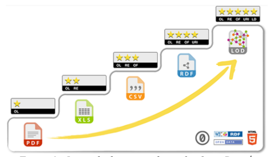
Figure 1–5-star deployment scheme for Open Data <sup>1</sup>.

The scattering of information is a significant issue for information retrieval which hampers the reusability of up-todate knowledge on the web. Tim Berners-Lee, the inventor of the World Wide Web, suggested a 5-star deployment scheme for sharing information on the web (figure 1).