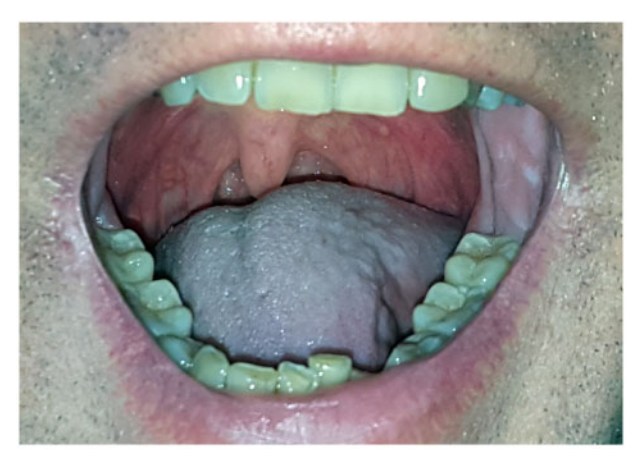
Figure 1. Right deviation of the tongue and soft palate related to left glossopharyngeal nerve (IX) palsy.

Neurosarcoidosis is a potentially severe disease affecting young adults with a mortality rate of 5%.2 The mean age at onset is 43.2 Neurological symptoms are observed in \sim 5% of patients