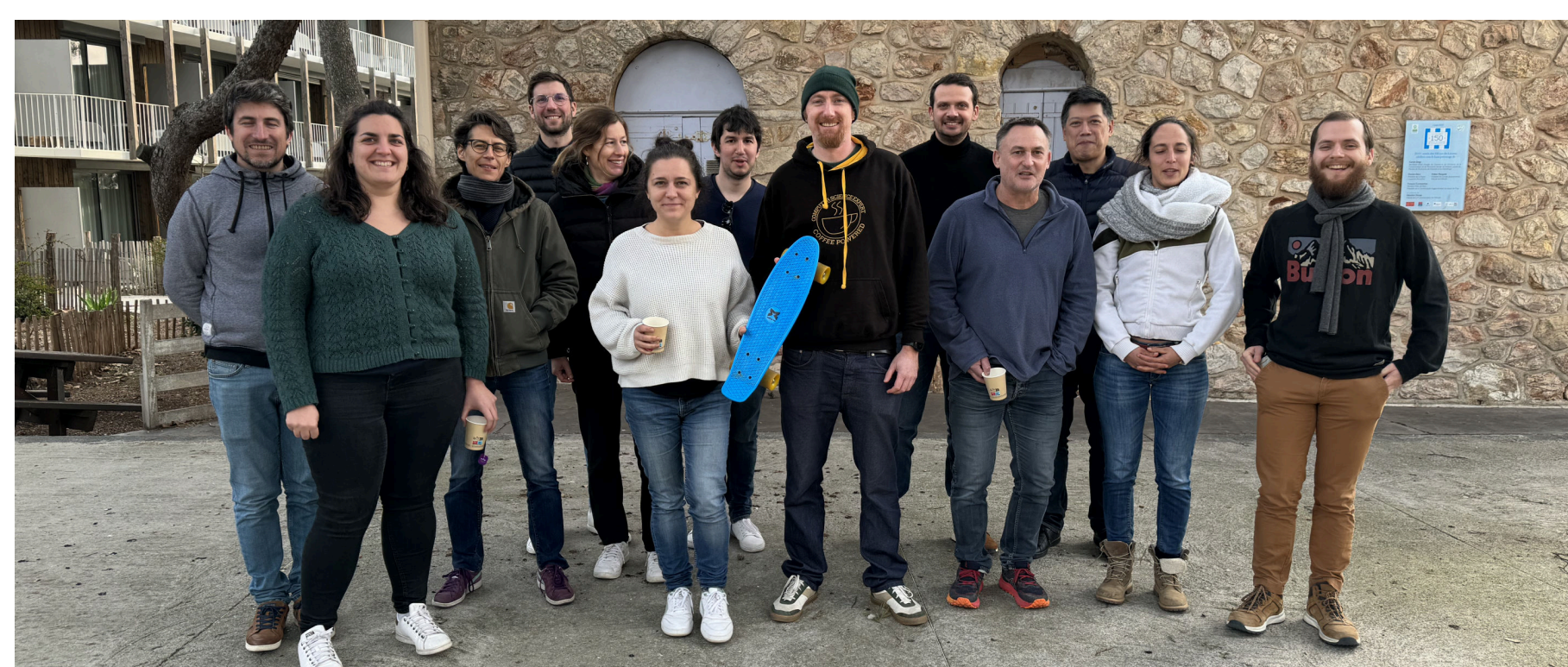
Hackaton SK8 2024 @ Sète