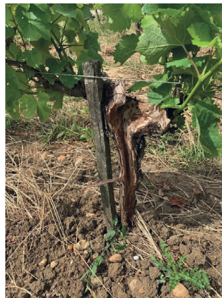
Figure 2. Examples of ‘Sauvignon Blanc’ vines curretted in the Couhins III-7 vineyard.