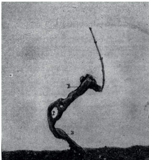
Figure 1. Illustration of a grapevine cured in 1919, as shown by Lafon (1921).

degree of efficacy because 90 to 95% of the cured plants were resilient. However, curettage remained a minority practice until its modernization and reintroduction in France at the beginning of the 21st Century (Larignon and Yobregat, 2016). This return has been associated with a combination of factors, including the ban of sodium arsenite, the only curative pesticide previously used to control esca (Bruez et al. , 2021a), that was forbidden in Europe in the first decade of the 21st century. Development of tools, such as lightweight chain saws, has also opened new possibilities for the use of curettage. Nowadays, necrotic wood is removed with thermal and/or electric saws, and an increasing number of operators are proposing curetting services to vine growers.