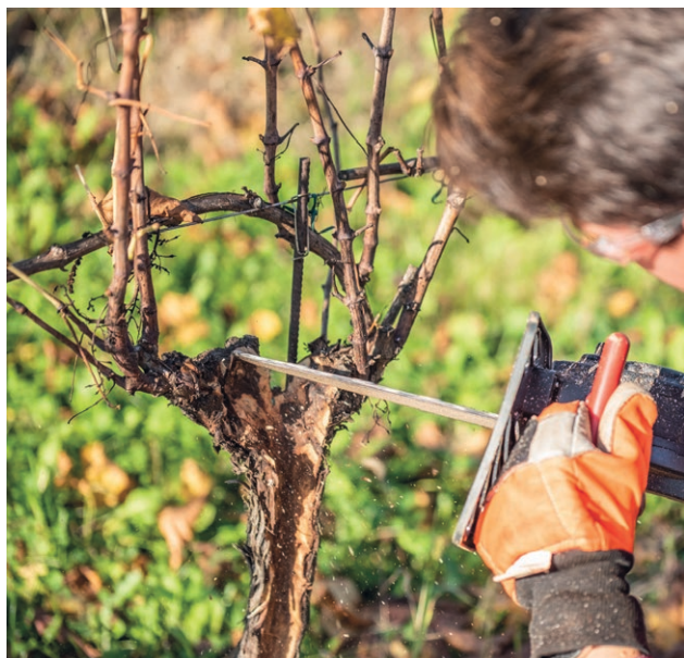
Figure 3. Illustration of the curettage technique, performed on a grapevine stock with a small chain saw.