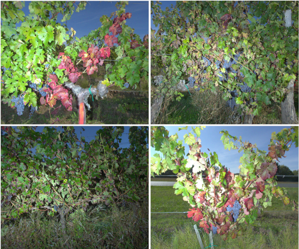
Fig. 3. Example of images of the classes (from top to bottom; left to right) "FD", "ESCA", "CONF" and "CONF+" of the CS20 dataset.