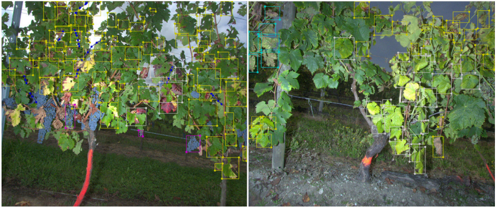
Fig. 4. An example of complete (left image) and soft annotation (right image) by bounding boxes and broken lines. In grey: Symptomatic leaves of FD. In yellow: confounding leaves. In purple: Symptomatic bunches. In dark blue: symptomatic shoots. In light blue: symptomatic leaves of ESCA.