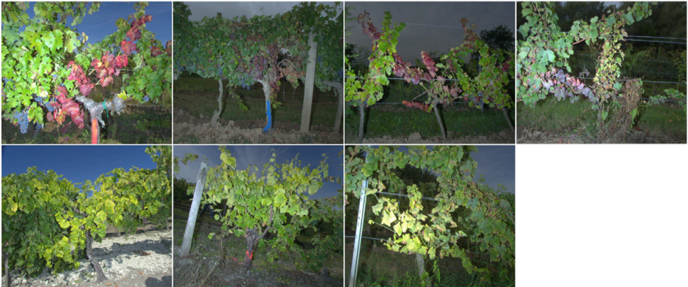
Fig. 2. Symptomatic grapevine suffering from FD of each dataset. From top to bottom, left to right: image of the dataset CS20, CS21, CF21, M21, UB20, UB21, SB21.