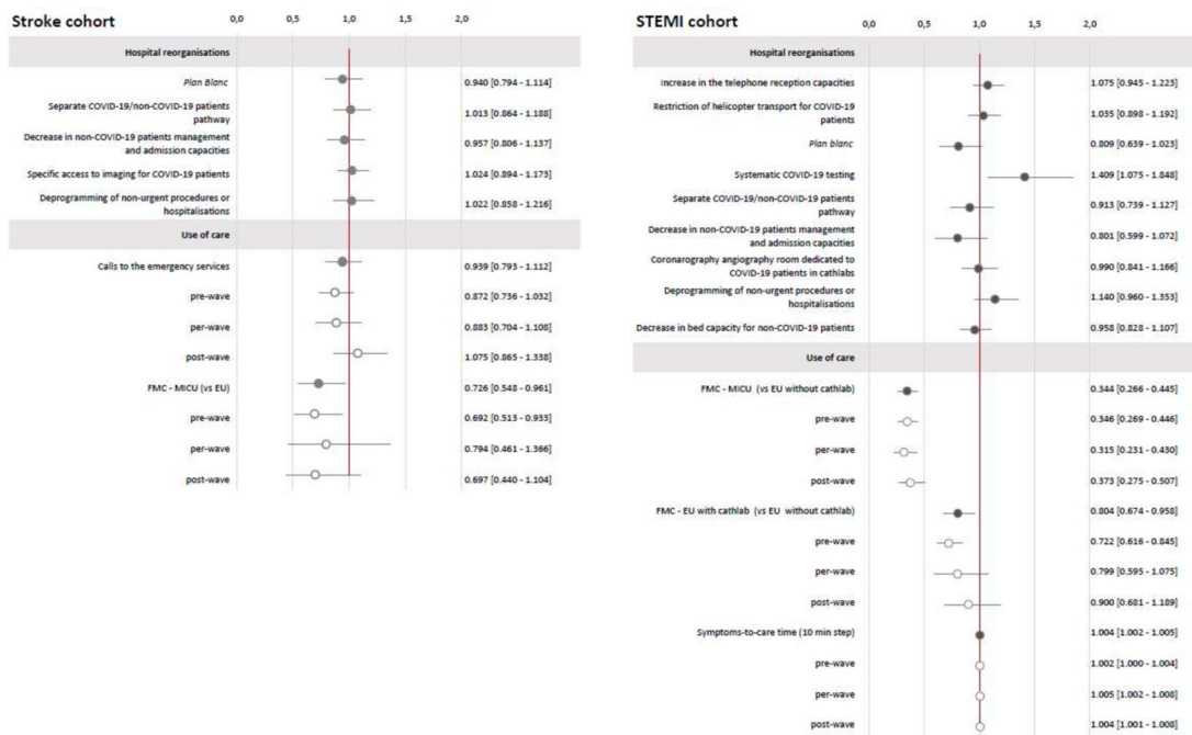
Figure 2 Stroke and STEMI cohorts. Estimation of the reorganisations and use of care effects (95% CI) on care management times. Stroke cohort (N=4603)—estimated overall effects expressed as \exp(\beta) with 95% CI; results of multivariate linear regression mixed models; variable to be explained: Y = \log(\text{EU admission-to-imaging time}) ; results adjusted on period, age, gender, urbanicity of residence, FDep15, APL MG 18, residence-EU distance, presence of stroke unit, MRI 24 hours a day, presence of interventional neuroradiology unit, care during on-call activity, mode of transport, calls to emergency services activity, mRS less than 1 before stroke, NIHSS at entry, previous stroke or transient ischaemic attack. STEMI cohort (N=1843)—estimated overall effects expressed as \exp(\beta) with 95% CI; results of multivariate linear regression mixed models; variable to be explained: Y = \log(\text{FMC-to-procedure time}) ; results adjusted on period, age, gender, urbanicity of residence, FDep15, APL MG 18, residence-to-cathlab distance, cathlab hospital status, care during on-call activity, mode of transport, calls to emergency services activity, FMC-to-cathlab distance, diabetes mellitus, coronary artery disease or STEMI history). Light grey: interaction with the COVID-19 period, Dark grey: raw results without interaction with the COVID-19 period. APL MG 2018, potential accessibility to general practitioners; EU, emergency unit; FDep15, deprivation index; FMC, first medical contact; MICU, mobile intensive care units; mRS, modified Rankin Scale; NIHSS, National Institute of Health Stroke Score; plan blanc, emergency plan to cope with a sudden increase of activity; STEMI, ST-segment elevation myocardial infarction.

suggest that these discordant results are a result of the variety of policies implemented and the heterogeneity of hospital organisations. To our knowledge, no study has analysed at a regional level the effect of reorganisations implemented by hospitals to deal with the COVID-19 pandemic. Those extant simply provide feedback on reorganisations at a local level. 11 39 40