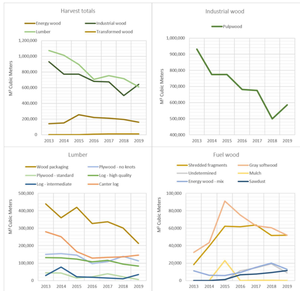
Figure 4. Consolidated harvest totals detailing flows of industrial, energy and lumber wood from 2013 to 2019.