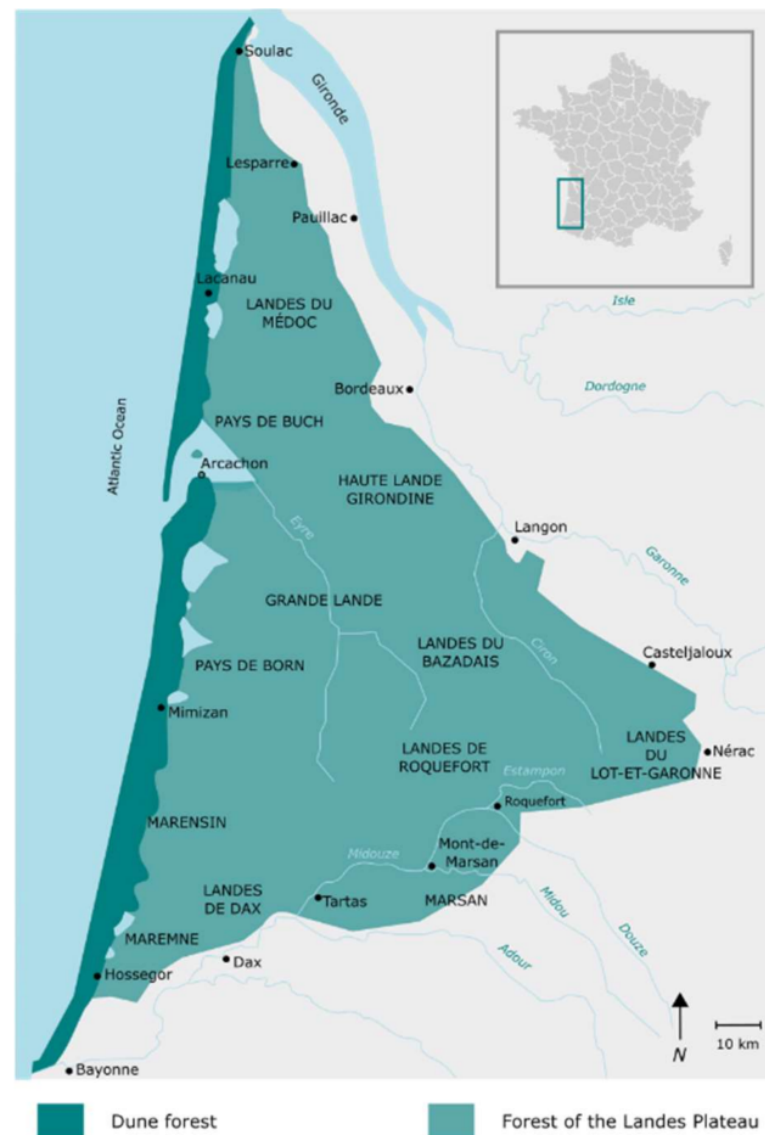
Figure 1. Location of Landes de Gascogne forest.

Landes de Gascogne forest is unique in Europe because it is almost entirely created and managed by man for specific industries. This forest was planted first to contain littoral dunes in the middle of the 19th century. The trees were then utilized for their resins and the forest was further developed and planted inward by Napoleon III. From the harvest of resin to maintain wooden ships, to the use of turpentine for lanterns and light, to the production of timber for mining and railway infrastructure, the economic applications of this unique forest have evolved throughout the years, fueled by market changes. Currently, the regional raw material flow of timber resources rests within market pulp and wood packaging. The harvesting technique is machinery harvesting only. The machine cut the trees in 2.5 m logs (100 inches). Today, the production of wood, populated only with maritime pine, occupies 897,000 hectares out of the 1,166,000 hectares of the Gascony forest. The rest (269,000 hectares) is shared between the coastal protection zone and about 100,000 hectares of oaks and various other species [13]. The majority of the forest is PEFC (Programme for the Endorsement of Forest Certification) certified. The production and allocation of timber products has never been static throughout its history, and moving forward into the future, this resource may pivot once again [14].