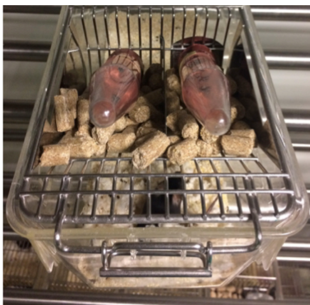
Figure 2. Position of the bottles. The position of the bottles is changed during the protocol (see Procedure) in order to habituate the mice to drink from both positions. However, bottles must be maintained at the same height and angle throughout the protocol. Note that food is distributed in both sides of the metal grid.